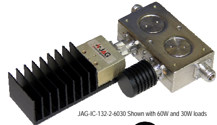
JAG-IC-132-2-6030 Shown with 60W and 30W loads